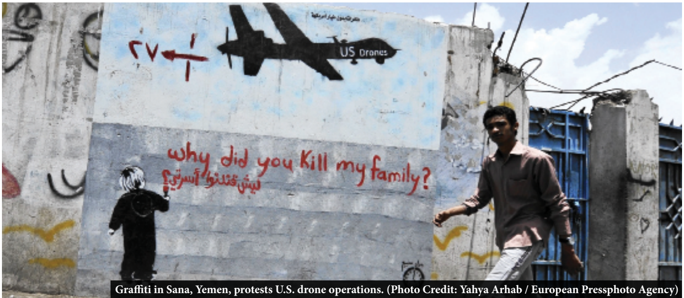
Graffiti in Sana, Yemen, protests U.S. drone operations.

estimated 83 were civilians. 31 These reports indicate the grotesque number of innocents killed by drones over the last few years and call into question the morality of such a weapon.